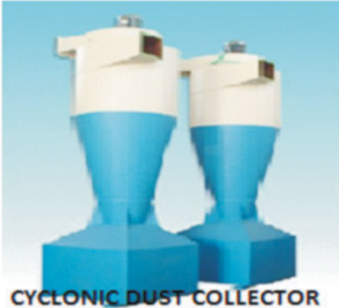
CYCLONIC DUST COLLECTOR