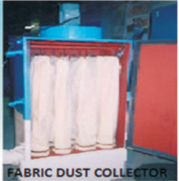
FABRIC DUST COLLECTOR